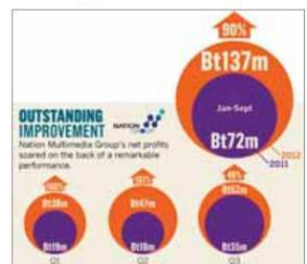
NMG Revenue.

Thailand's (SET) Opportunity Day, she said that after its launch in September, KKTV has achieved the monthly ad target of 10mn baht. Next year, it should generate 15mn baht a month. According to Nielsen Thailand, overall ad spending in the first 10