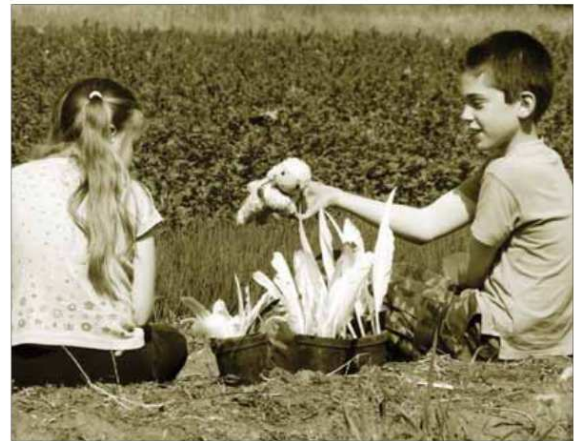
LET'S TRADE: Learn about how to use responsible lending to your advantage by investing in Exchange Traded Funds.

This category of ETFs will invest in commodities, which may include precious metals such as gold or silver. However, investors need to be aware that commodity