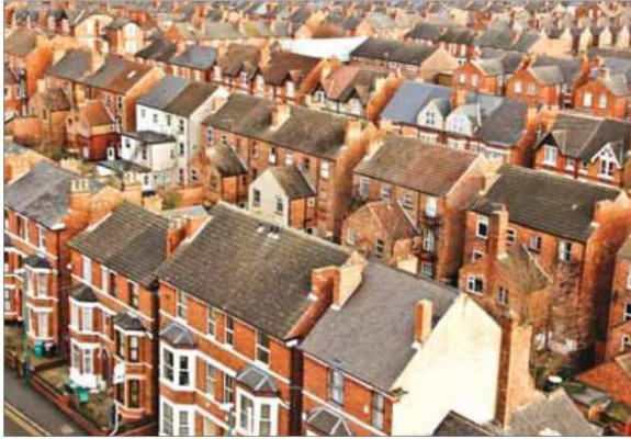
If you have left the UK to seek sunnier climes, you might find the inheritance tax will follow you across the globe.

There are two types of domicile; by origin and by choice. Domicile by origin obviously can't be changed and it is usually based on the domicile of the father. However one can establish a domicile of choice by choosing to make a permanent home somewhere abroad after they have reached the age of 16. To do this you not only have to prove your new home is permanent, but also that you have